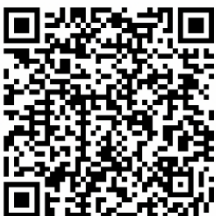
EnergyConnect Factsheet Construction

Please feel free to contact us by phone 1800 49 06 66 or email pec.community@elecnor.es or logon to www.transgrid.com.au/energyconnect for further information about the project. To learn more about general construction activities and the construction of our overhead transmission lines please scan the QR Codes below.