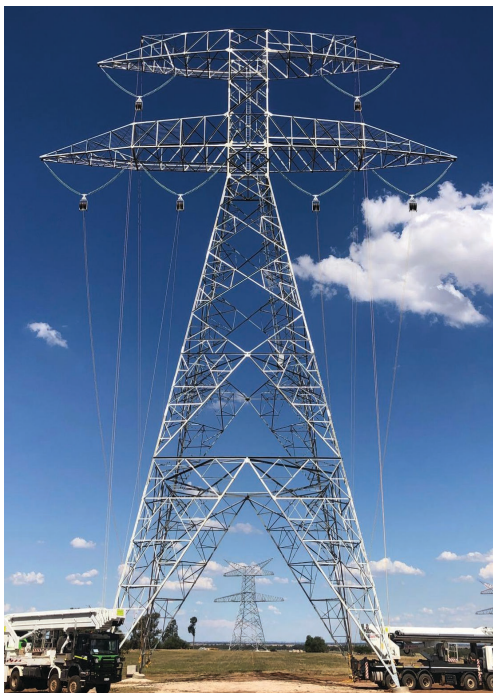
Danubio tower at Lockhart, NSW.

*Indicative stringing works in this area until September 2025. However, schedules can change due to unforeseen circumstances.